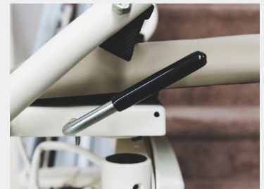
Swivel seat for a safe exit