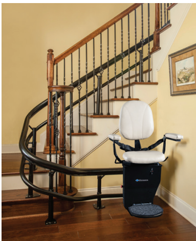
Curved Stair Lifts (Black rail/seat)