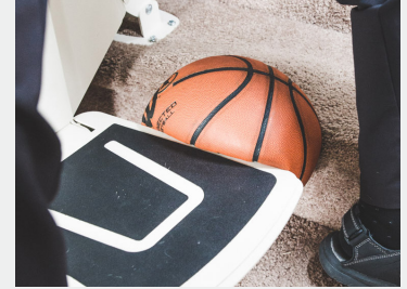
Safety obstruction sensors.