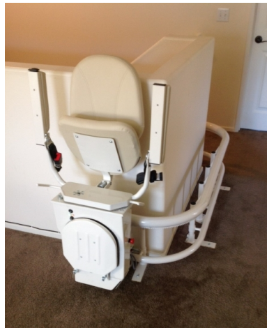
Curved Stair Lifts (Cream rail/seat)