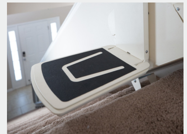
Wide footrests for stability and extra comfort.*

* Wider foot rest vary slightly in style on each Navigator model. See model detail for more information.